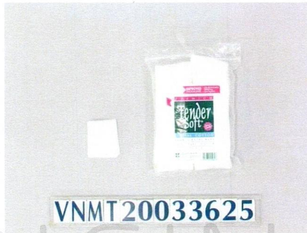
Mẫu 1 (Mẫu A)

Báo cáo này (bao gồm cả tài liệu và hình ảnh đính kèm) được phát hành dành riêng cho việc sử dụng và phục vụ cho lợi ích của đơn vị yêu cầu theo đúng mục đích đã yêu cầu. Bất kỳ phần nào trong nội dung của báo cáo cũng không được sửa đổi, sao chép hay phân phối cho bất kỳ đơn vị thứ ba nào nếu không có sự đồng ý bằng văn bản từ phía chúng tôi. Chúng tôi hoàn toàn không chịu trách nhiệm nếu báo cáo này được sử dụng cho một mục đích khác với mục đích ban đầu, và chúng tôi cũng không chịu trách nhiệm với bất kỳ bên nào khác về bản báo cáo này.